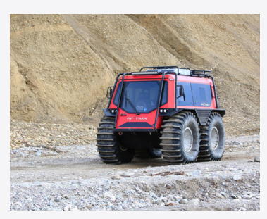
4) Fat Truck Tour: 2.5 hours $299 Per Person

Start with a three-mile ATV trail ride to your launching point through the scenic Alaskan wilderness. After gearing up, certified guides will lead you along six sky bridges and seven thrilling zip lines. Over half a mile of zips including the dual racer finale!