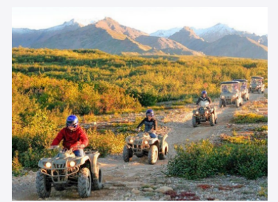
1) ATV 4-Wheeler Adventure 2 hours $150 Single Rider $250 Double Riders $350 Triple Riders $450 Quad Riders

Ride on several terrain types. rocky creek beds, hills to climb, water to traverse, and mud crossings. Total tour of about 10 miles. Approximately 1 ½ hours on the actual trails.