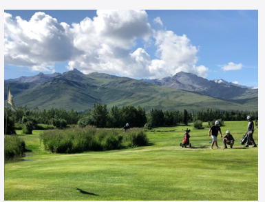
2) 9-Hole Tundra Golf: 2 hours $125 Per Person

Ride on several terrain types. rocky creek beds, hills to climb, water to traverse, and mud crossings. Total tour of about 10 miles. Approximately 1 ½ hours on the actual trails.