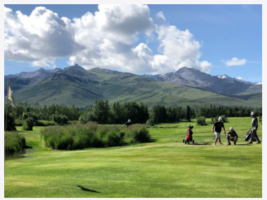
2) 9-Hole Tundra Golf: 2 hours $125 Per Person

climb, water to traverse, and mud crossings. Total tour of about covers Approximately 1 ½ hours on the actual trails.