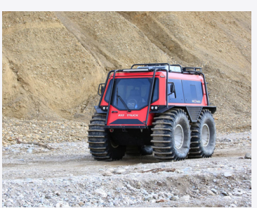
4) Fat Truck Tour: 2.5 hours $299 Per Person

Start with a three-mile ATV trail ride to your launching point through the scenic Alaskan wilderness. After gearing up, certified guides will lead you along six sky bridges and seven thrilling zip lines. Over half a mile of zips including the dual racer finale!