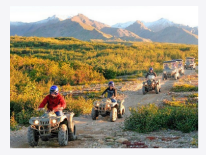
1) ATV 4-Wheeler Adventure 2 hours $150 Single Rider $250 Double Riders $350 Triple Riders $450 Quad Riders

climb, water to traverse, and mud crossings. Total tour of about covers Approximately 1 ½ hours on the actual trails.