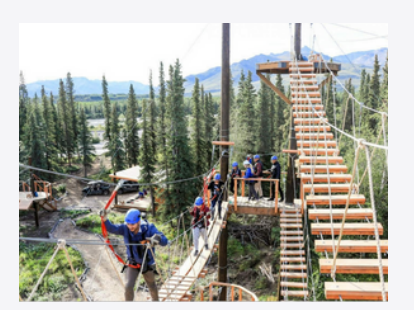
3) Denali Zip Line: 3 hours $165 Per Person

Black Diamond is a challenging course with "Alaskan hazards," such as tundra marshes or Ride on several terrain types. even the occasional moose There are coal mining trails, hoof print! The course is rocky creek beds, hills to relatively short, which makes it accessible and fun for any style play. equipment miles. provided.