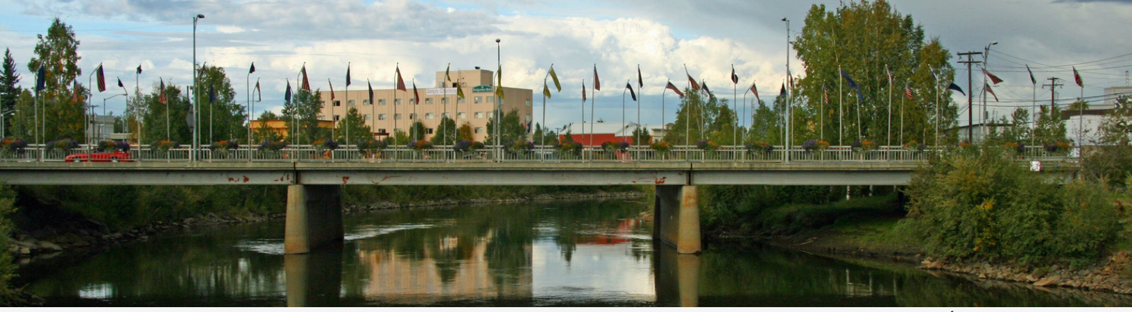
PRE-NIGHT* | FAIRBANKS: Upon arrival in Fairbanks, call for your hotel courtesy shuttle or contact a local taxi (depending on your choice of hotel). Rest up for your tour that begins at 8:00 AM the following morning.

DAY 01 | FAIRBANKS/DENALI NATIONAL PARK: Today you will be met your guide in the lobby of your hotel at 8:00 AM. Your guide will assist with your luggage as you load up and set off on your adventure. Your Denali Fall Colors Tour begins with a scenic drive from Fairbanks to Denali National Park. This 2-hour drive offers great views and opportunities for possible wildlife sightings. A lunch stop is provided prior to your scheduled park tour. (Meal not included.)